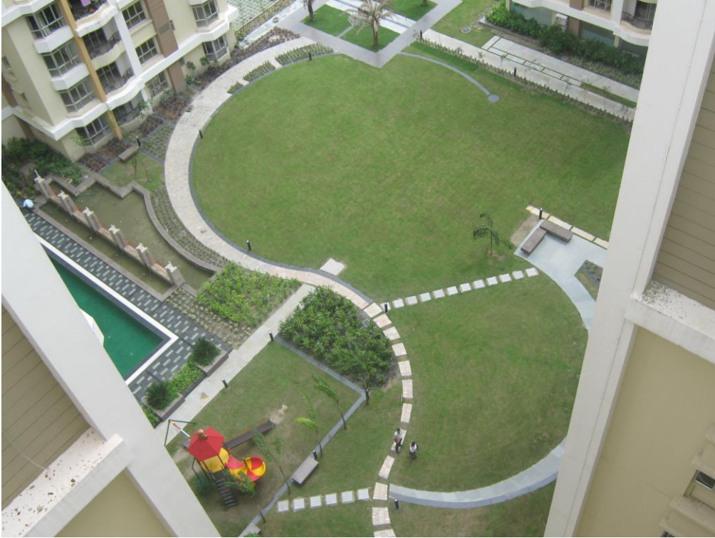
Orbit Sky View, Central Court, Off to B.T. Road, Kolkata